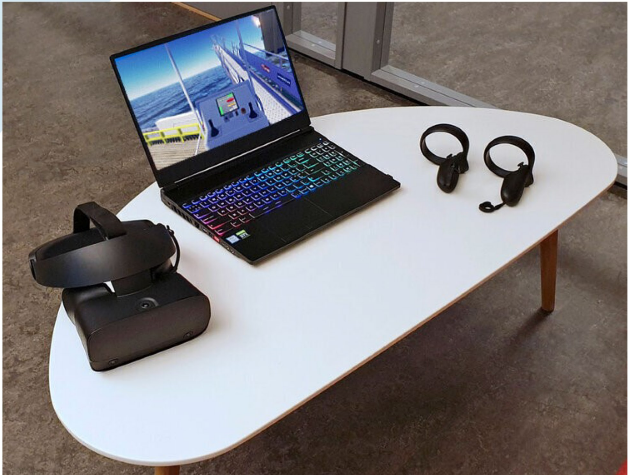
Mobile setup, fits in a laptop backpack